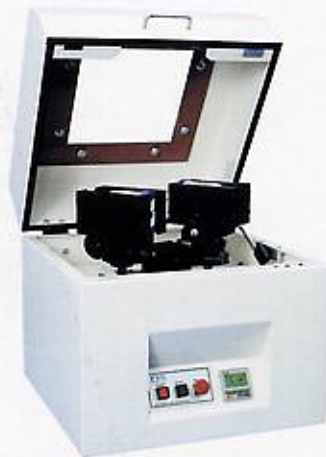
Solder Paste Softener