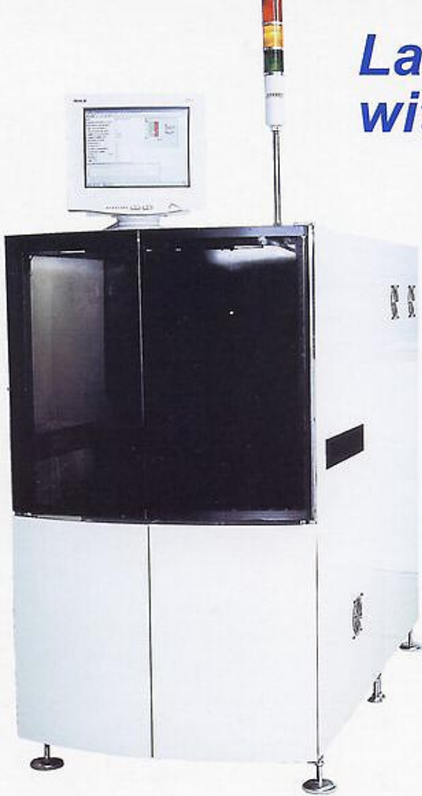
In-Line Laser Marker