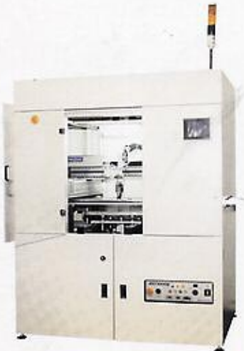
In-Line Epoxy Dispenser

PTS Laser marking system incorporates the most advanced laser, optics and servo control software available today. Marks graphics, logos, text, barcodes on flat or round surfaces. X-Y servo driven table allows for precision multiple laser firing position over a wide area of the PCB. Digital vision positional correction system through PCB fiducial recognition enhances the system repeatability and accuracy of markings. Build-in scanner verifier ensures bar-code readability. SPC software stores historical data of marks created and provides real time quality trend. CAD file interpreter allows the import of scanned or drawn graphics. User friendly software running on Windows 2000 TM. Auto width adjustment of conveyor minimise setup time. Integrated build in exhaust with filter system.