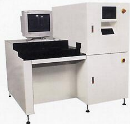
Laser Marker Workstation