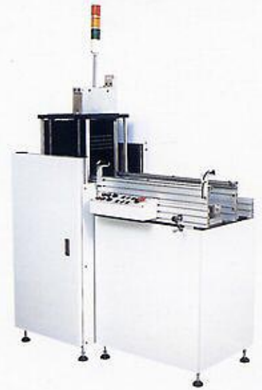
Magazine Buffer Stocker