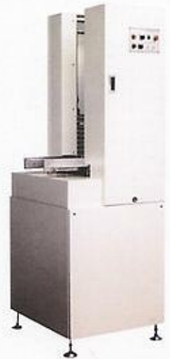
Chain Buffer Stocker