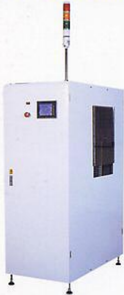
Multipurpose Buffer Stocker