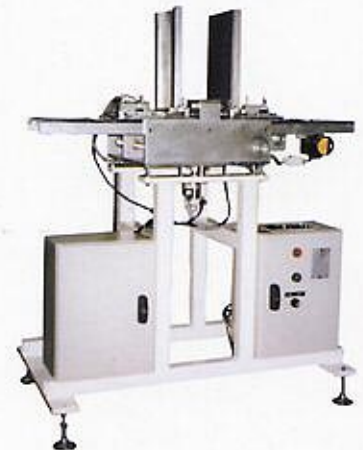
In-Line Connector Assembly